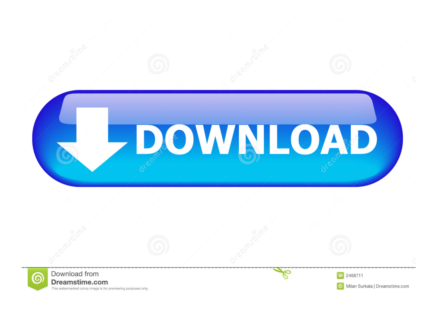
Guitar Pro 7.5.2 Build 1600 Pre-Activated